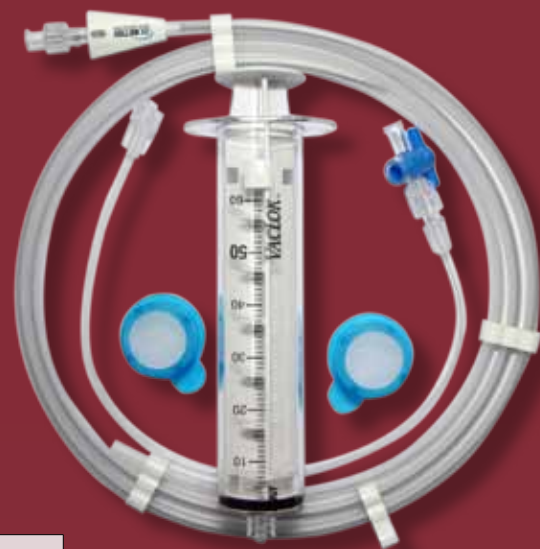
Aspiration Catheter Set

The Biometrix Thrombus Aspiration Catheter incorporates a smooth tip design to increase pushability and a unique hydrophilic coating to escalate trackability. The Aspicath's excellent pushability is also due to the innovative shaft design and the kink resistance, specifically designed for aspiration catheters.